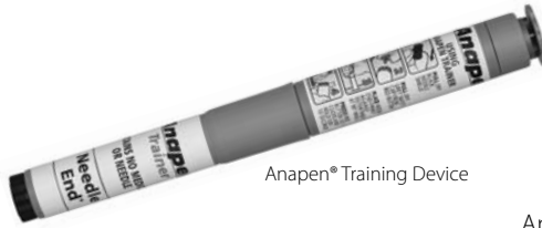
Anapen ® Training Device

Anaphylaxis Australia has Anapen ® Trainers and Anapen ® Training Kits available for training purposes.